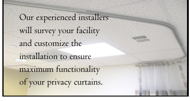
Cubicle and Drapery Manufacturing